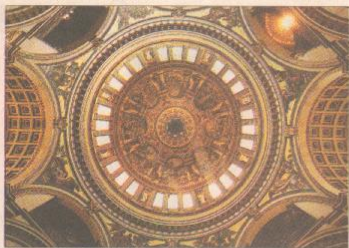
Restoration has brightened the interior of St Paul's, left. A view of the dome, above, and a stained glass window, right